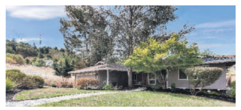
371 Castello Road, Lafayette - Listed at $1,425,000 SOLD! Represented Seller