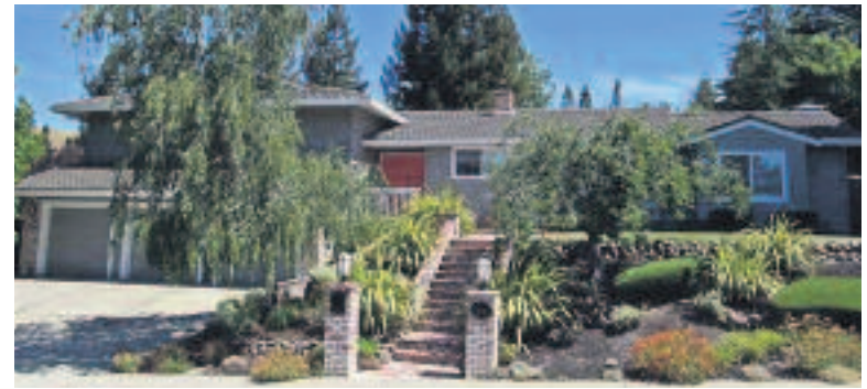
1018 Richard Lane, Danville - Listed at $1,649,000 SOLD! Represented Buyer