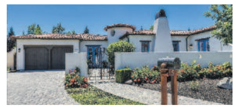
5 Whiting Court, Moraga - Listed at $1,485,000 SOLD! Represented Buyer

02014 Coldwell Banker Real Batte LLC. All Rights Reserved Coldwell Banker® is a registered trademark licensed to doublet fluender Real Batte LLC. An land Opportunity Exc Cooperating Each Coldwell Banker Residential Brokerage are independent contractor used associates and are not employee of Coldwell Banker Real Eat LLC. Coldwell Banker Residential Protecting or NRT LLC CallR License 09/09/08/04.